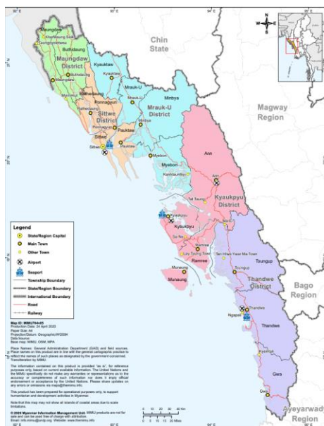
Figure 1: Map of Rakhine State 6

Table 1 shows the geographic coverage of different interventions, calculated using the number of villages/ wards where the intervention is implemented divided by the total number of villages/ wards per township. In this overview, duplications where multiple donors were funding the same activities in the same village were taken out, which means each village/ ward was only counted once. 7