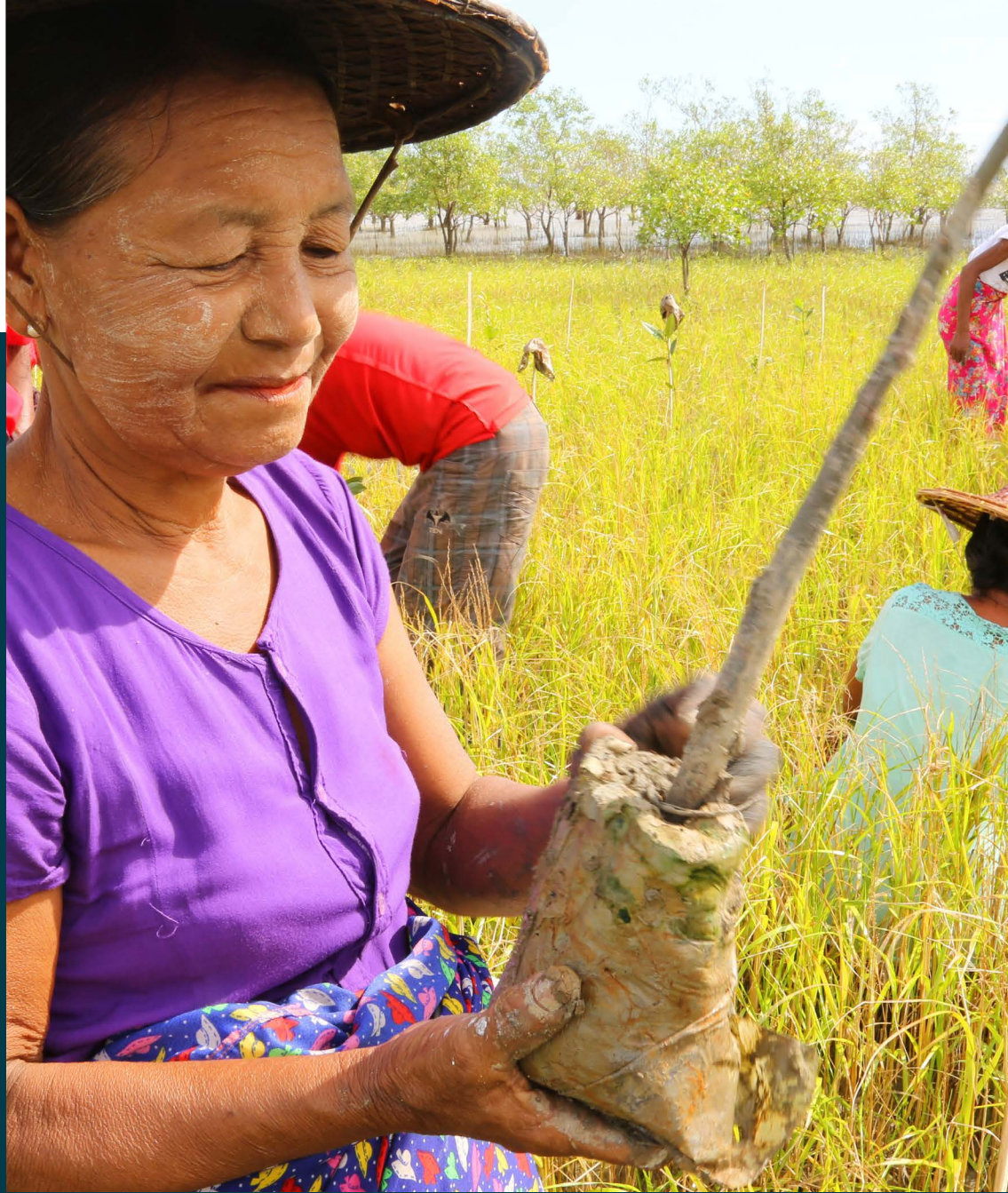
Mangrove restoration